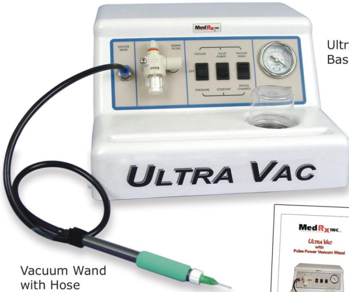
UltraVac Base Unit