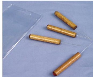
Cleaning Tool Kit