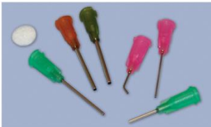
6 Vacuum Wand Tips & Drying Chamber Filter