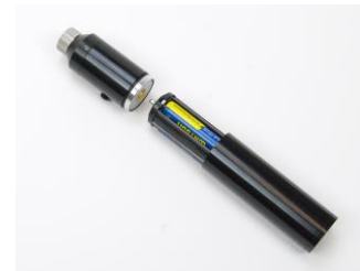
End cap removed showing batteries in holder and inserted into handle.