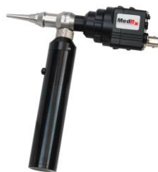
LED light handle installed on Oscope. (Note: Black button to turn the light on and off)