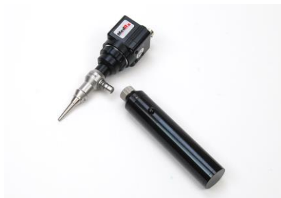
LED light handle in position to install on Oscope.