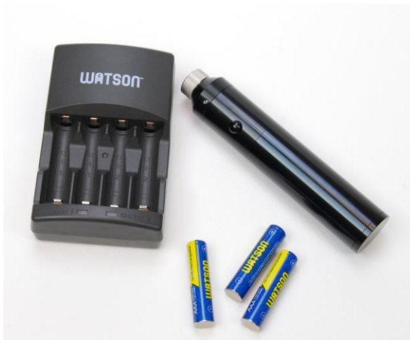
The LED light handle has three components: the Black Light Handle, the rechargeable batteries and the Battery Charger.